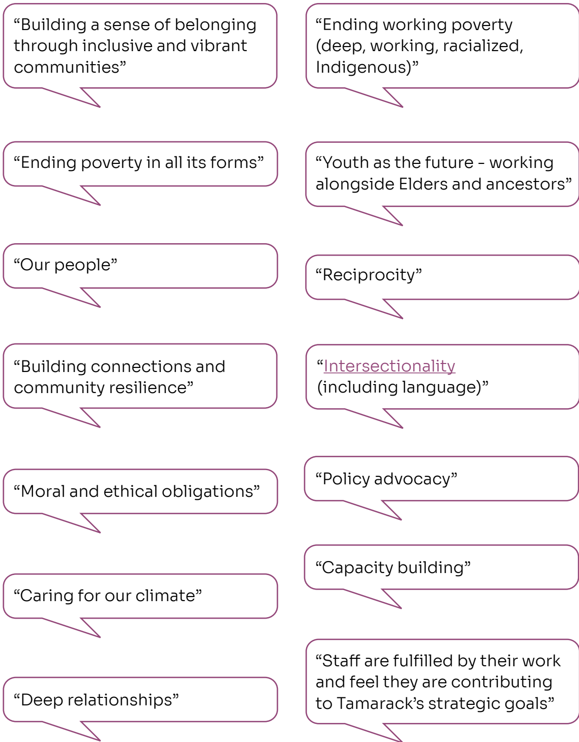
Figure 1: Areas that Tamarack Institute team members indicated that the organization cares about.