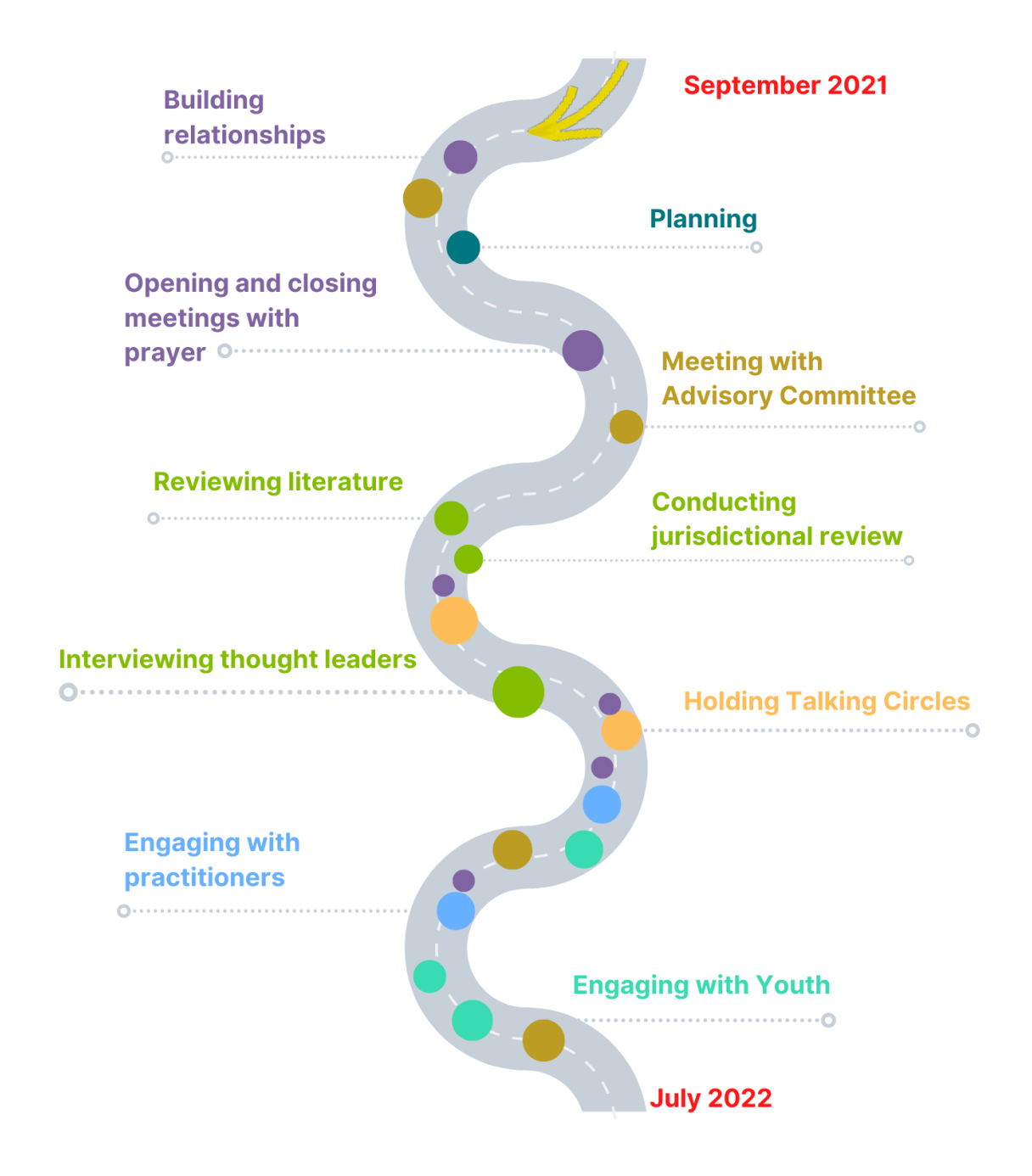
Figure 1. Project timeline and activities.

In this section we describe the activities that we undertook to facilitate our learning journey and achieve the project purpose. For a detailed description of methods, see Appendix A . Our goal was to describe child and youth well-being for use among diverse communities across the continuum of child welfare services and programs in Alberta. See Figure 1 for an overview of our activities and timelines.